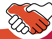
Commune awareness raising campaign on budget cycle process: where the revenue comes from and where it will be spent by February 2018