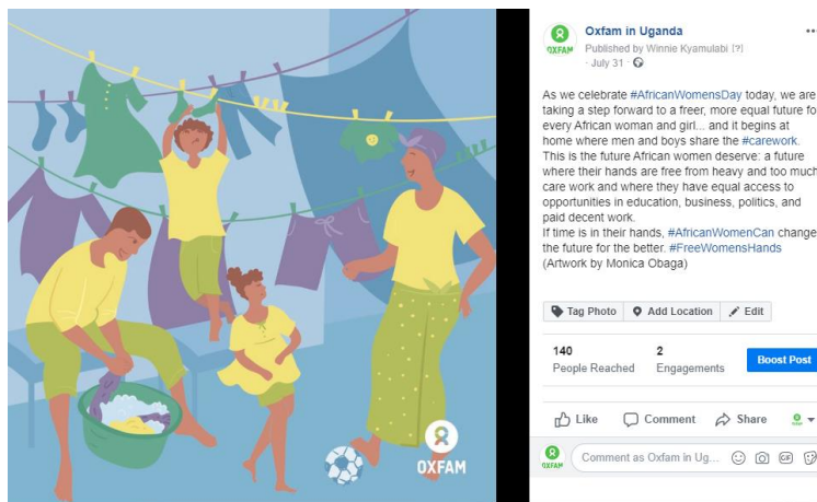
One of the online engagements encouraging people to take a step forward to a freer, more equal future for every African woman and girl.

The African Union set aside July 31 st for the commemoration of the African Women’s Day, popularly known as the Pan African Women’s Day which offers a national, continental and global opportunity to recall and affirm the significant role played by women in the evolution of a strong Pan Africa identity, with shared values, objectives and vision for the future.