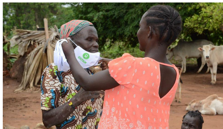
Some of the people who received materials distributed by CECI IN Bidi Bidi Refugee settlement.

The distribution was aimed at supporting vulnerable groups to effectively prevent the spread of COVID-19. The CECI team reached over 400 people during the distribution, creating more awareness about COVID-19 and how to control its spread.