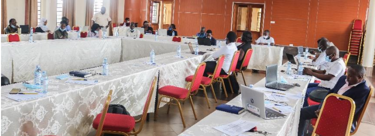
CSOs under the Tax Justice Alliance developing alternative tax proposals for FY2021/22.