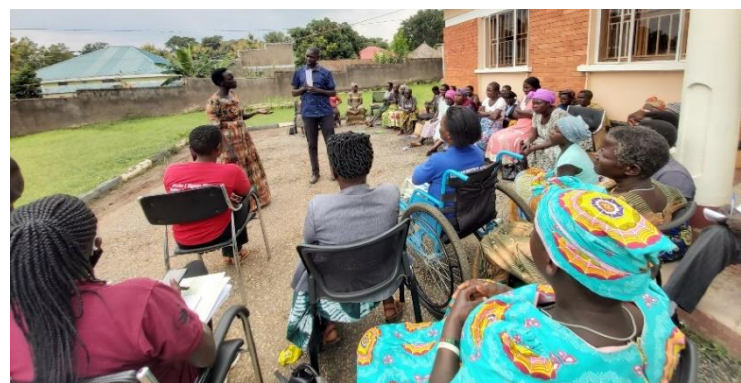
Women sharing their experiences on land disputes.