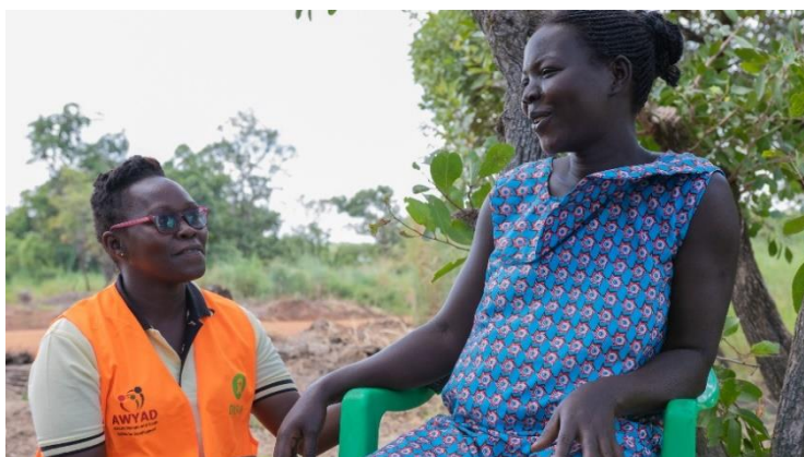
Local humanitarian actors are at the forefront of responding to crises.