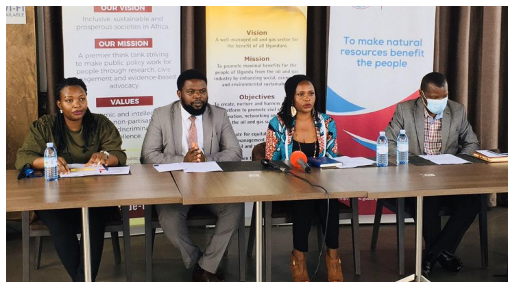
Civil society organizations briefing the media following the admission of Uganda as the 54 th member of the Extractive Industries Transparency Initiative on 13 th August 2020.

The EITI standard also requires the participation of women and marginalized groups such that oil, gas, and mining operations are managed in an equitable manner.