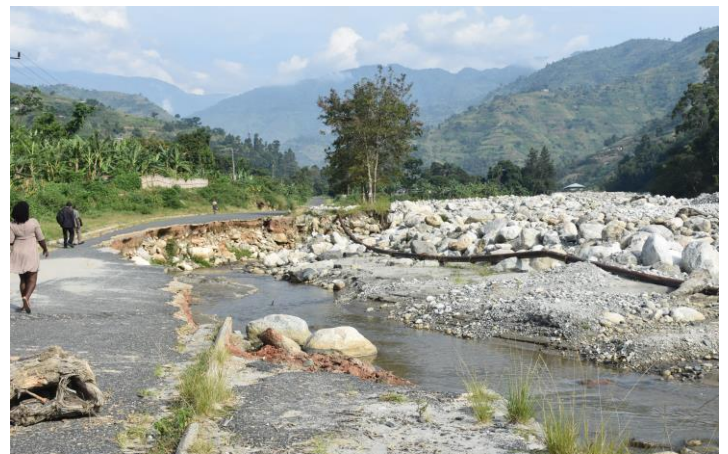
A major road in Kilembe Mines, Kasese district was destroyed by the devastation floods that burst the banks of river Nyamwamba.

In addition, climate finance of about 80% comes in form of loans which means that the world’s poorest countries are forced to go into debt to protect themselves from emissions made by wealthy countries.