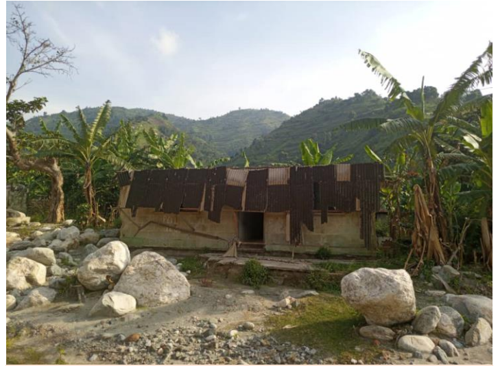
A deserted house in Kilembe mines that was destroyed by flash floods as a result of climate change.

In order to strengthen the adaptive capacity of communities, locally-appropriate, gender-sensitive adaptation plans and funds are needed, to reduce vulnerability to climate impacts and to strengthen resilience.